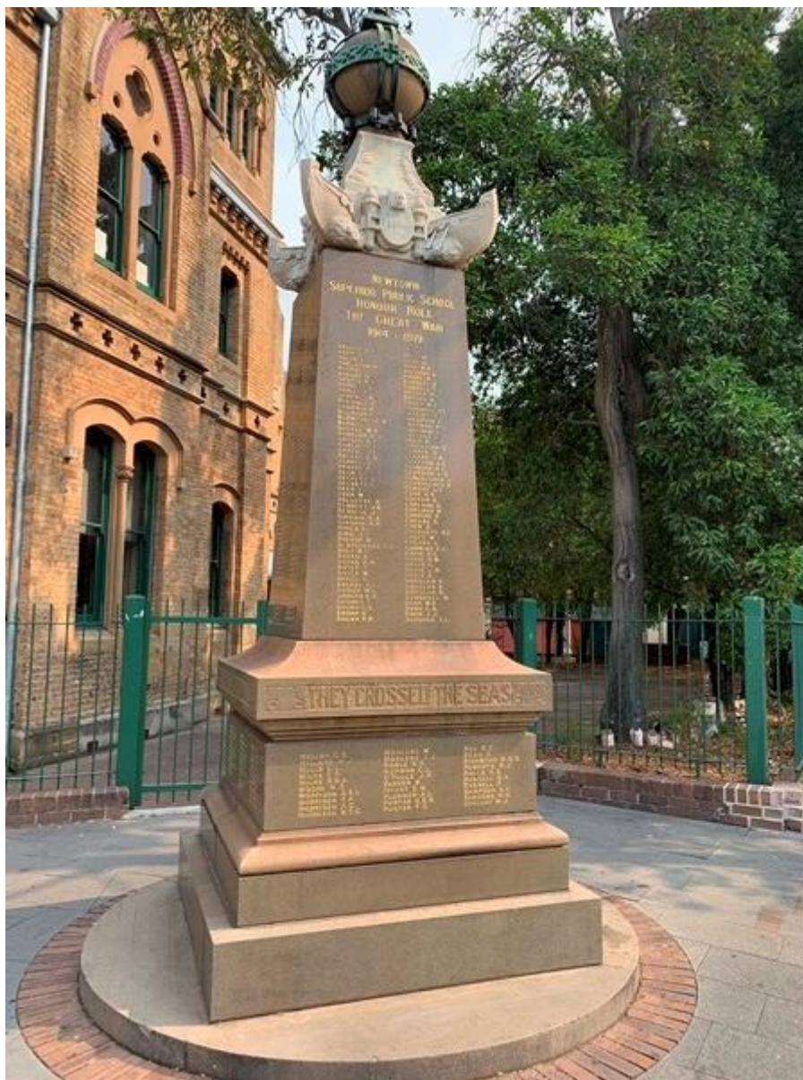
Newtown Superior Public School Great War Honour Roll