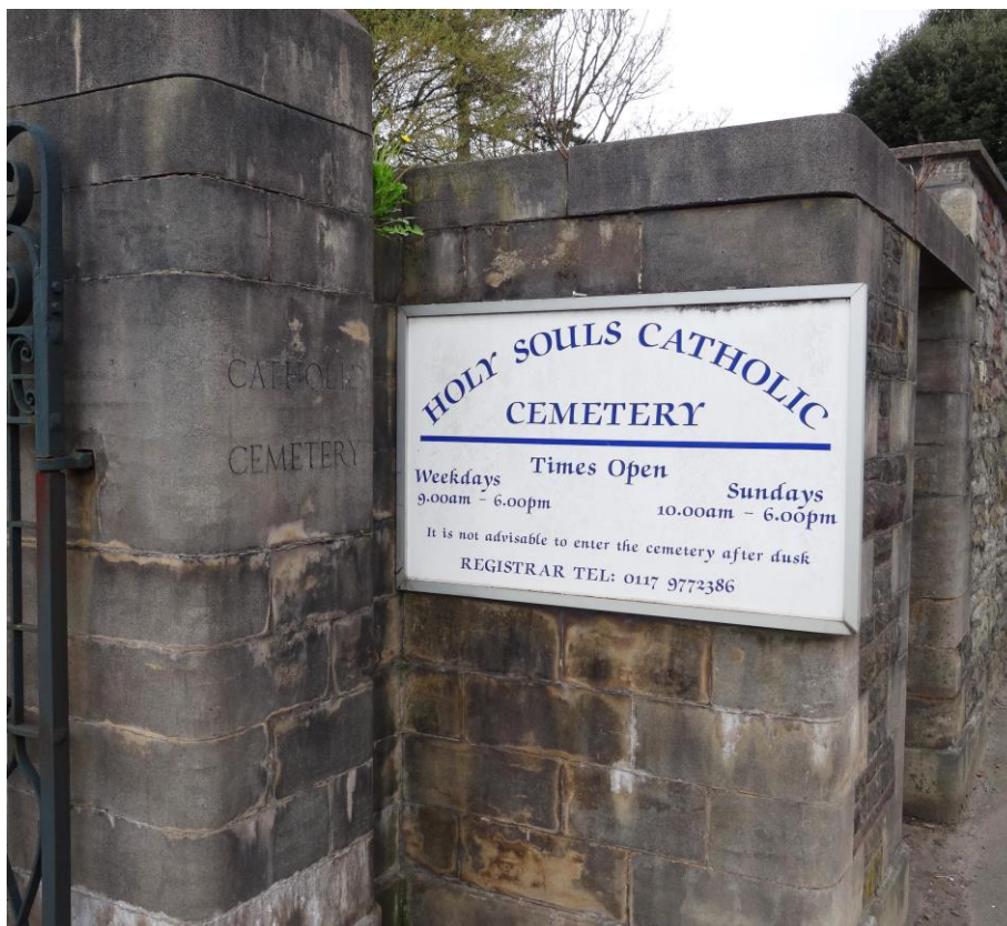
Holy Souls Roman Catholic Cemetery