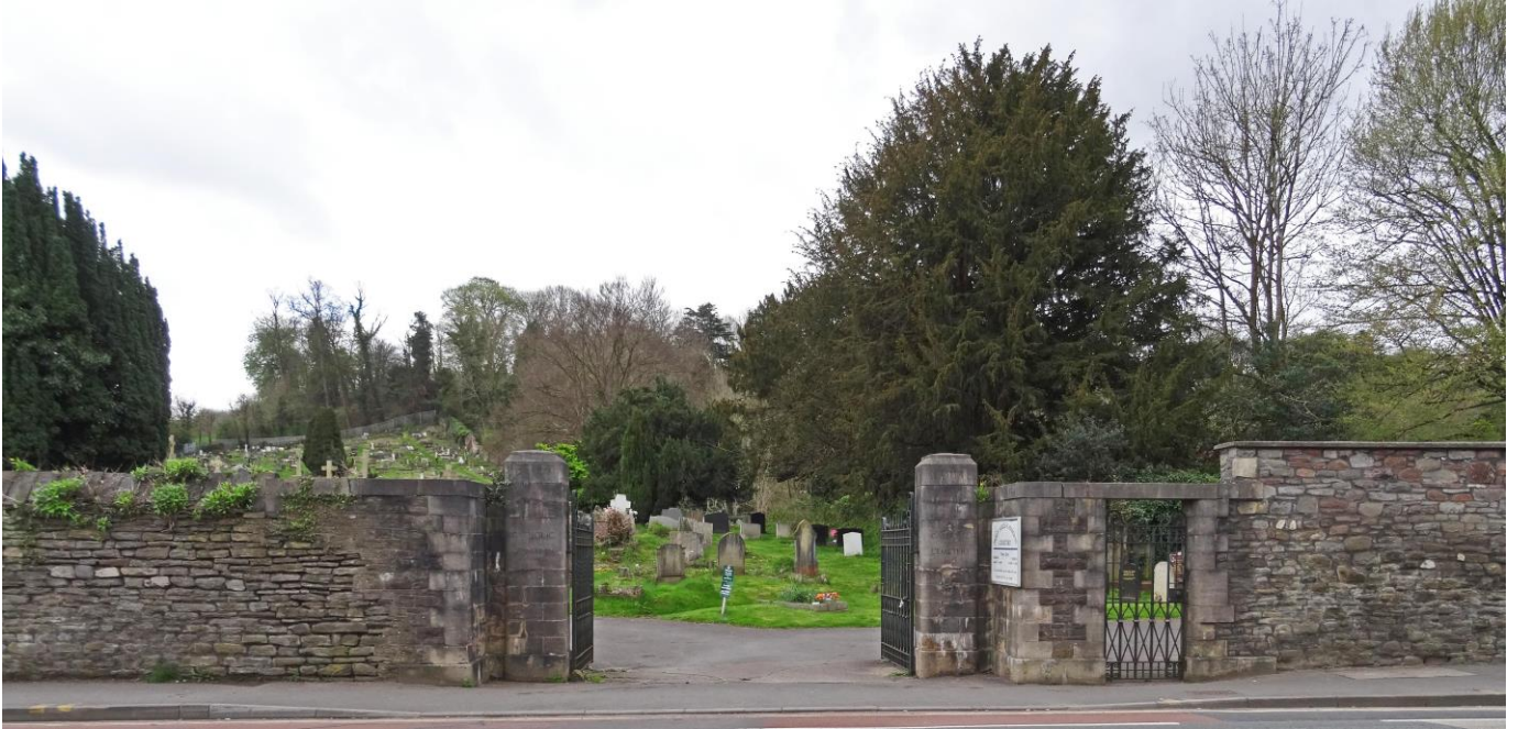
Holy Souls Roman Catholic Cemetery